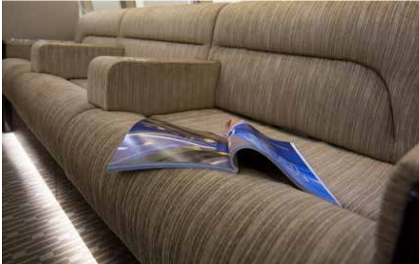
Aft Divan Detail