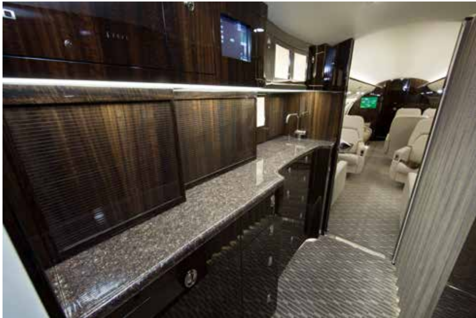
Forward Galley Closed