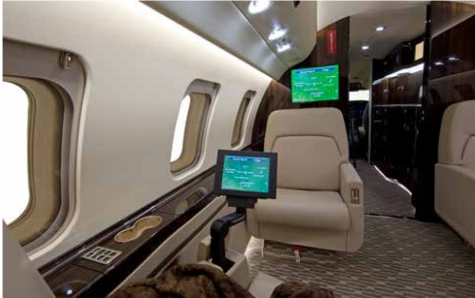
Forward CEO Seat