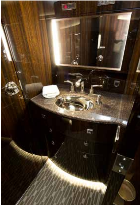
Aft Lav Vanity