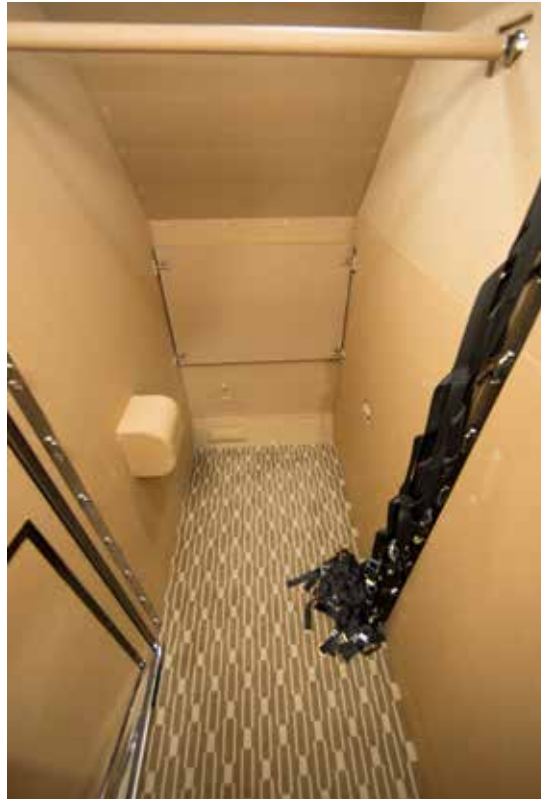
Aft Baggage Area