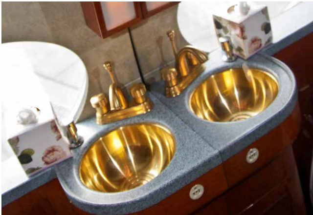
Forward Lavatory Vanity

Specifications are subject to verification by purchaser. Aircraft is subject to prior sale, and/or removal from the market without prior notice.