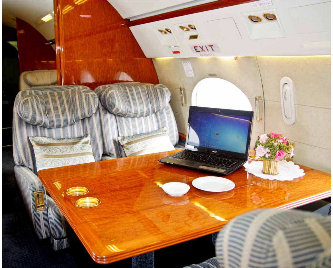
Mid-Cabin Conference Group

(HQ) Raleigh +1 919-941-8400 info@jetcraft.com www.jetcraft.com