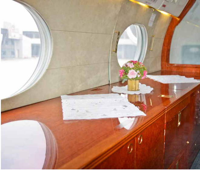
Mid-Cabin Credenza Detail