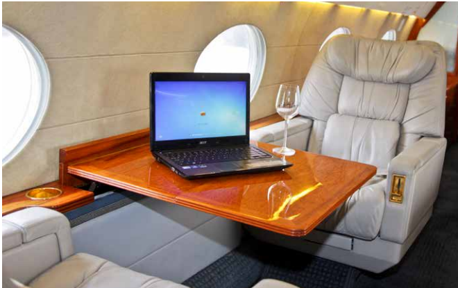
Forward Cabin Seat Detail

Specifications are subject to verification by purchaser. Aircraft is subject to prior sale, and/or removal from the market without prior notice.