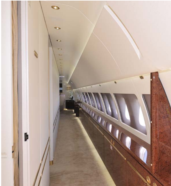
Side Hall Leading from Forward to Aft