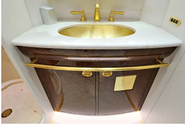
Executive Lavatory Vanity