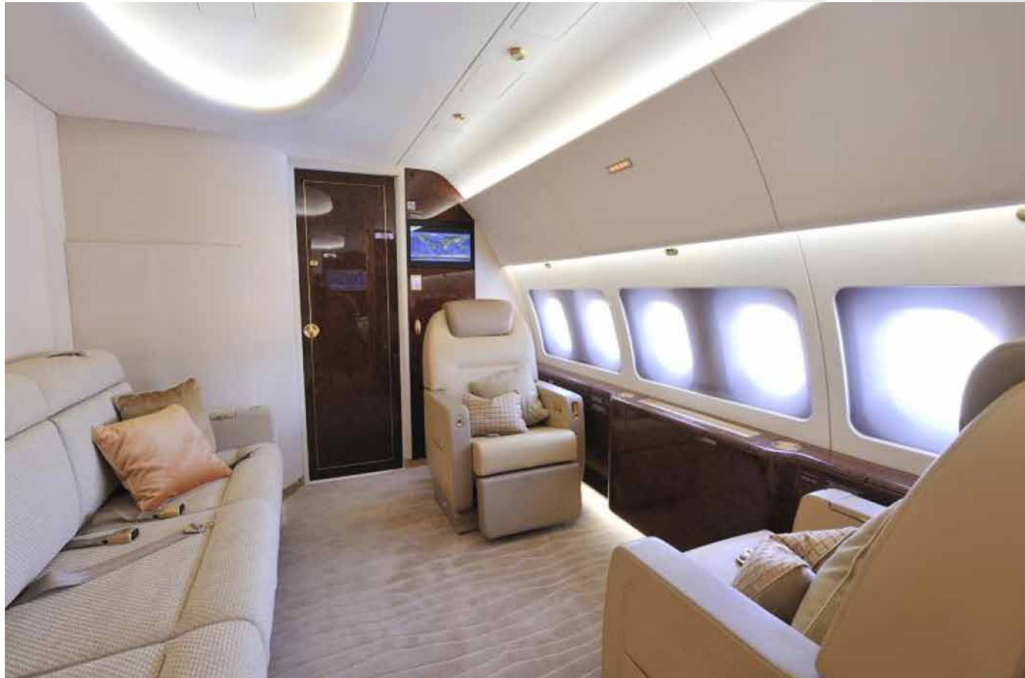
Forward Executive Lounge Area with Convertible Beds

Specifications and/or descriptions are provided as introductory information only and do not constitute representations or warranties. Verification of specifications remain the sole responsibility of purchaser. Aircraft is subject to prior sale, lease, and/or removal from the market without prior notice.