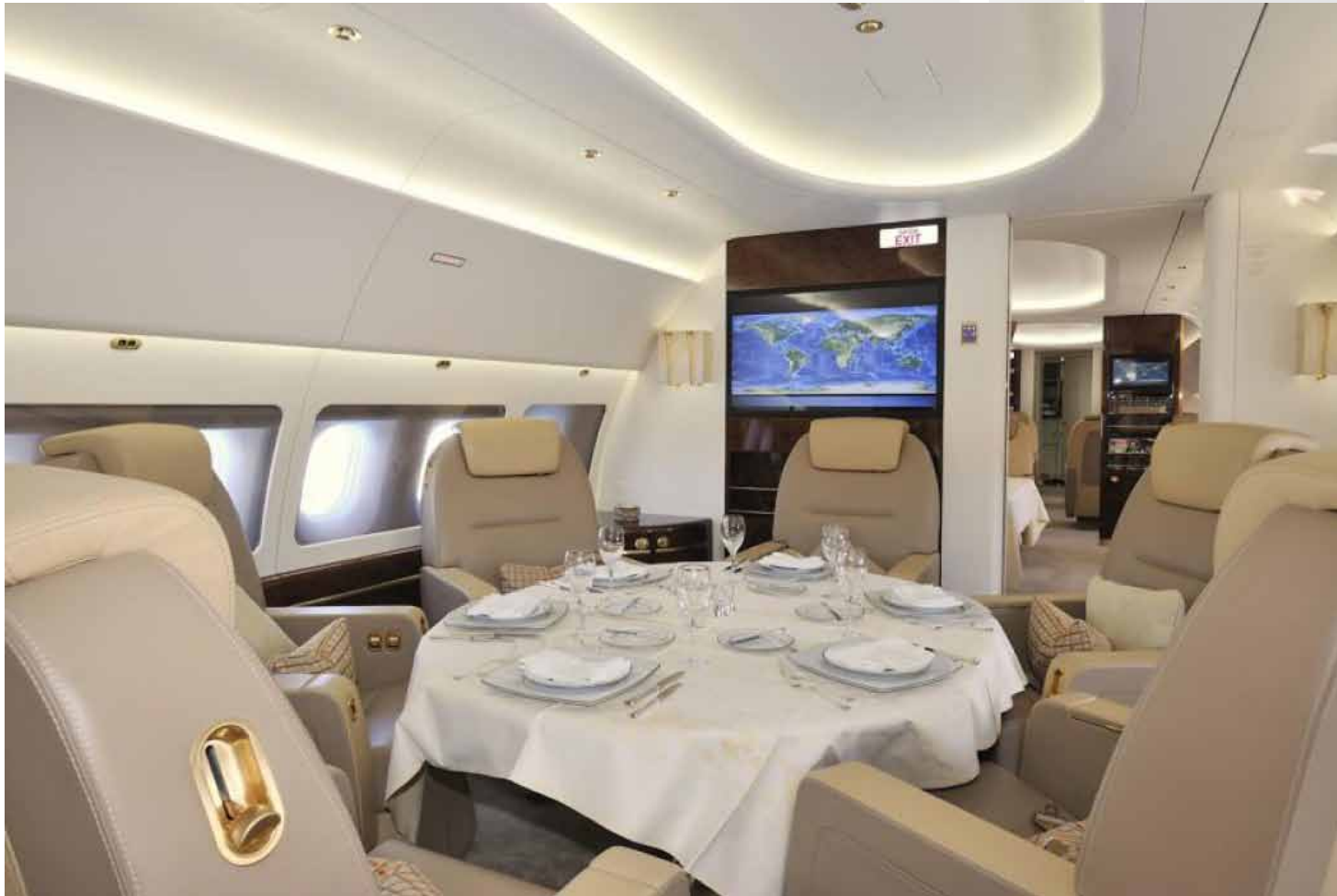
Six Place Conference/Dining Table

Specifications and/or descriptions are provided as introductory information only and do not constitute representations or warranties. Verification of specifications remain the sole responsibility of purchaser. Aircraft is subject to prior sale, lease, and/or removal from the market without prior notice.