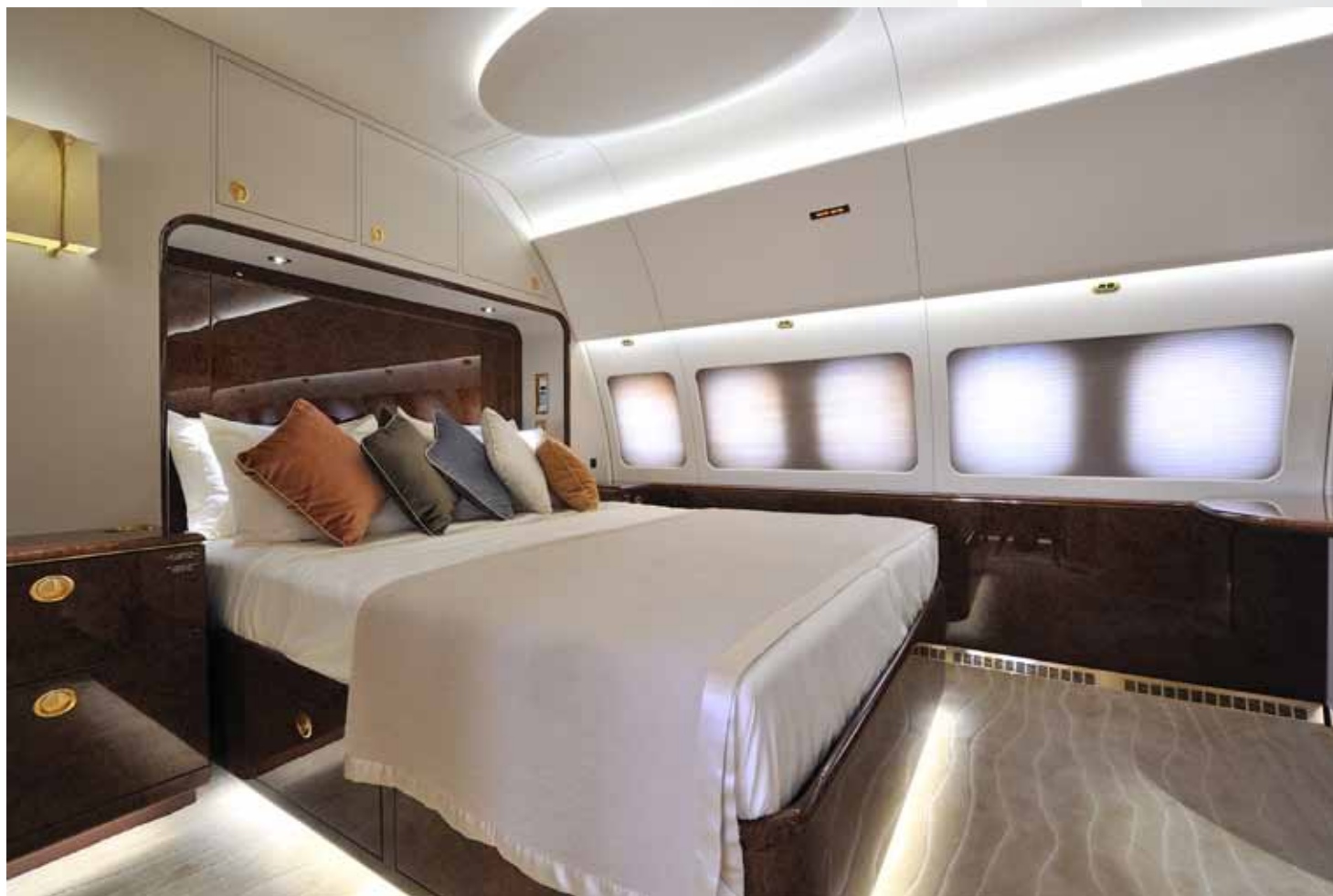
Forward Executive Bedroom

Specifications and/or descriptions are provided as introductory information only and do not constitute representations or warranties. Verification of specifications remain the sole responsibility of purchaser. Aircraft is subject to prior sale, lease, and/or removal from the market without prior notice.