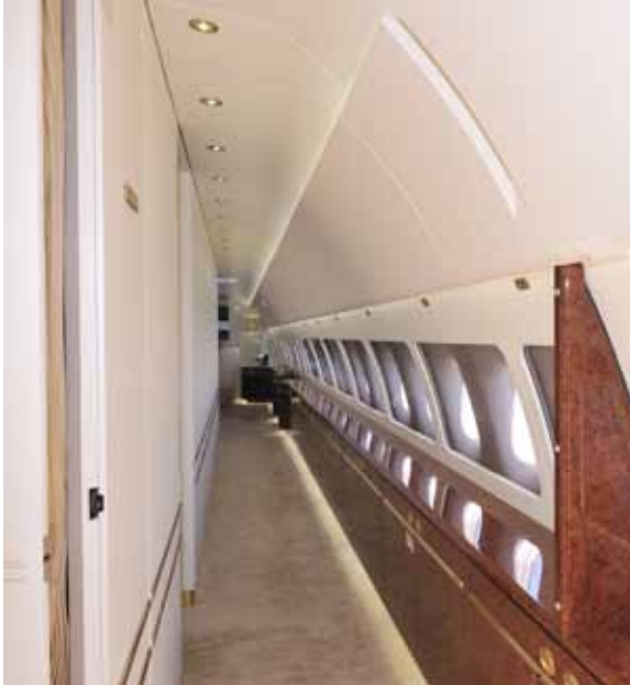
Side Hall Leading from Forward to Aft