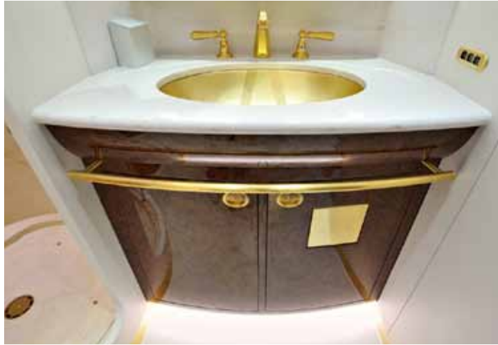
Executive Lavatory Vanity