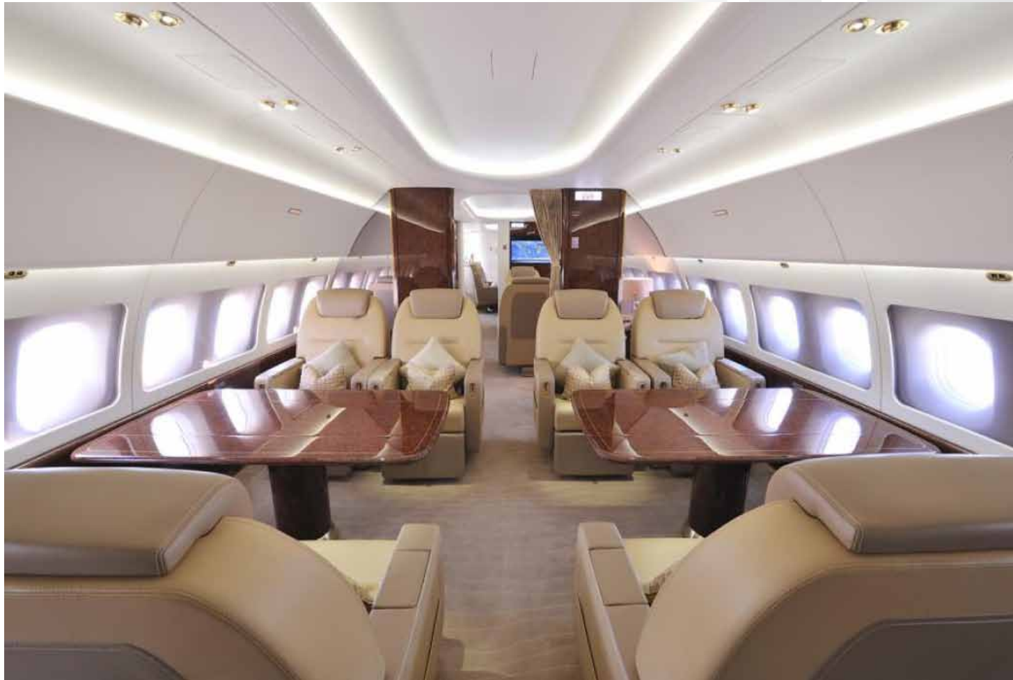
Aft First Class Seating with Convertible Beds

Specifications and/or descriptions are provided as introductory information only and do not constitute representations or warranties. Verification of specifications remain the sole responsibility of purchaser. Aircraft is subject to prior sale, lease, and/or removal from the market without prior notice.