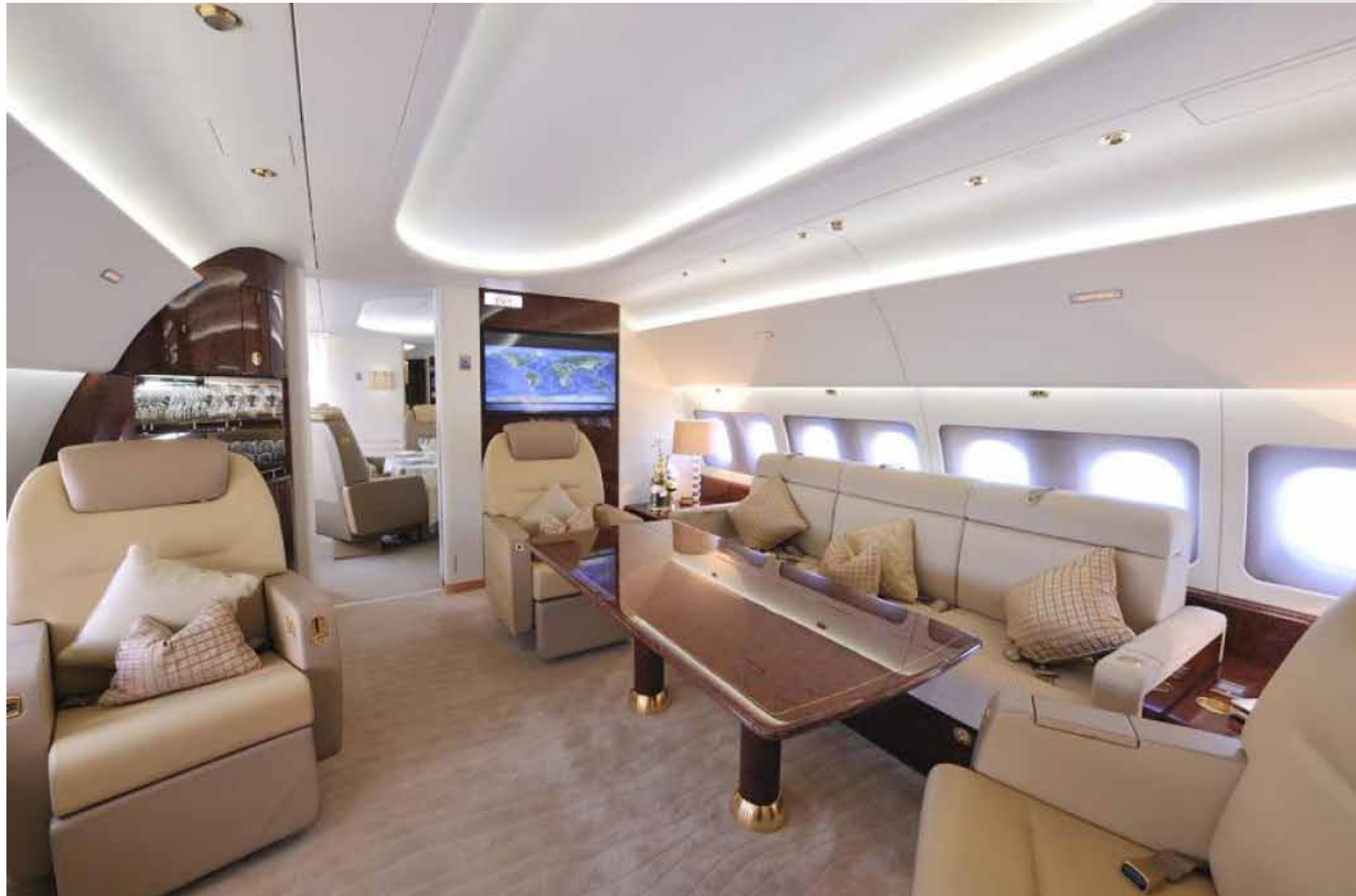
Aft Lounge with Convertible Beds

Specifications and/or descriptions are provided as introductory information only and do not constitute representations or warranties. Verification of specifications remain the sole responsibility of purchaser. Aircraft is subject to prior sale, lease, and/or removal from the market without prior notice.