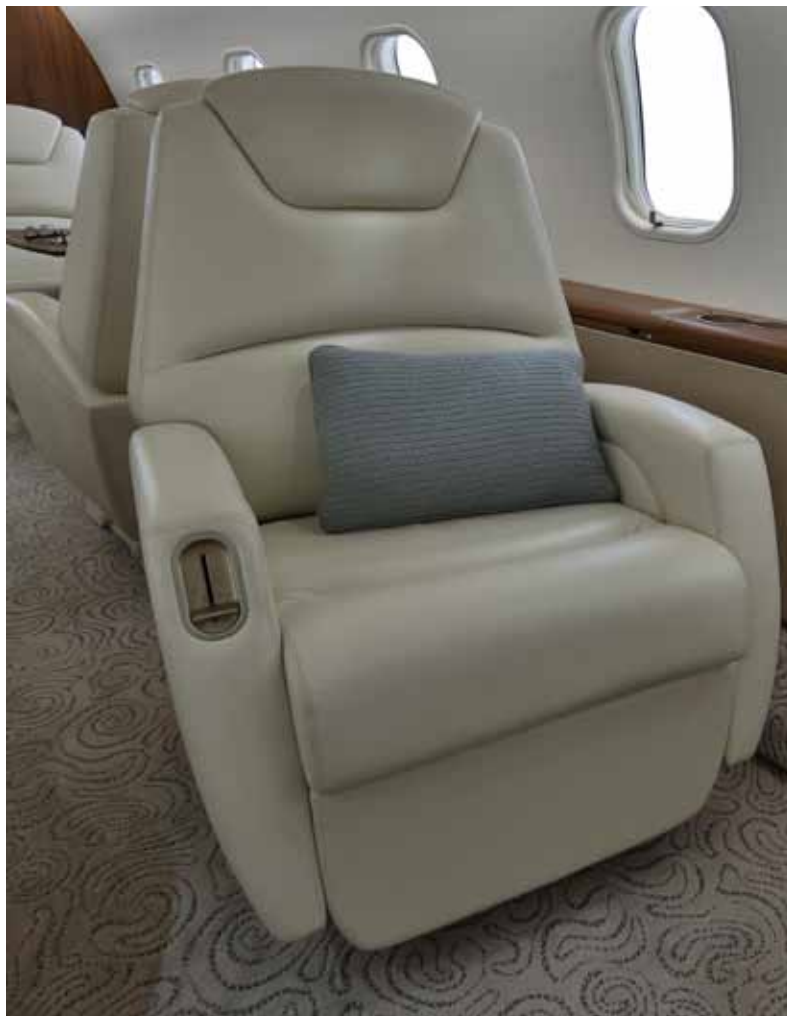
Seat - Closed