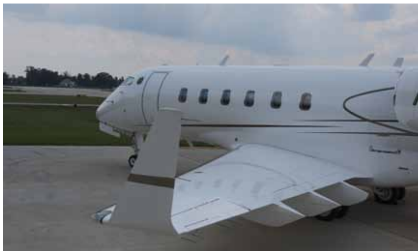
Exterior - Wing Tip