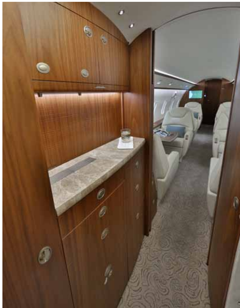
Galley - Closed