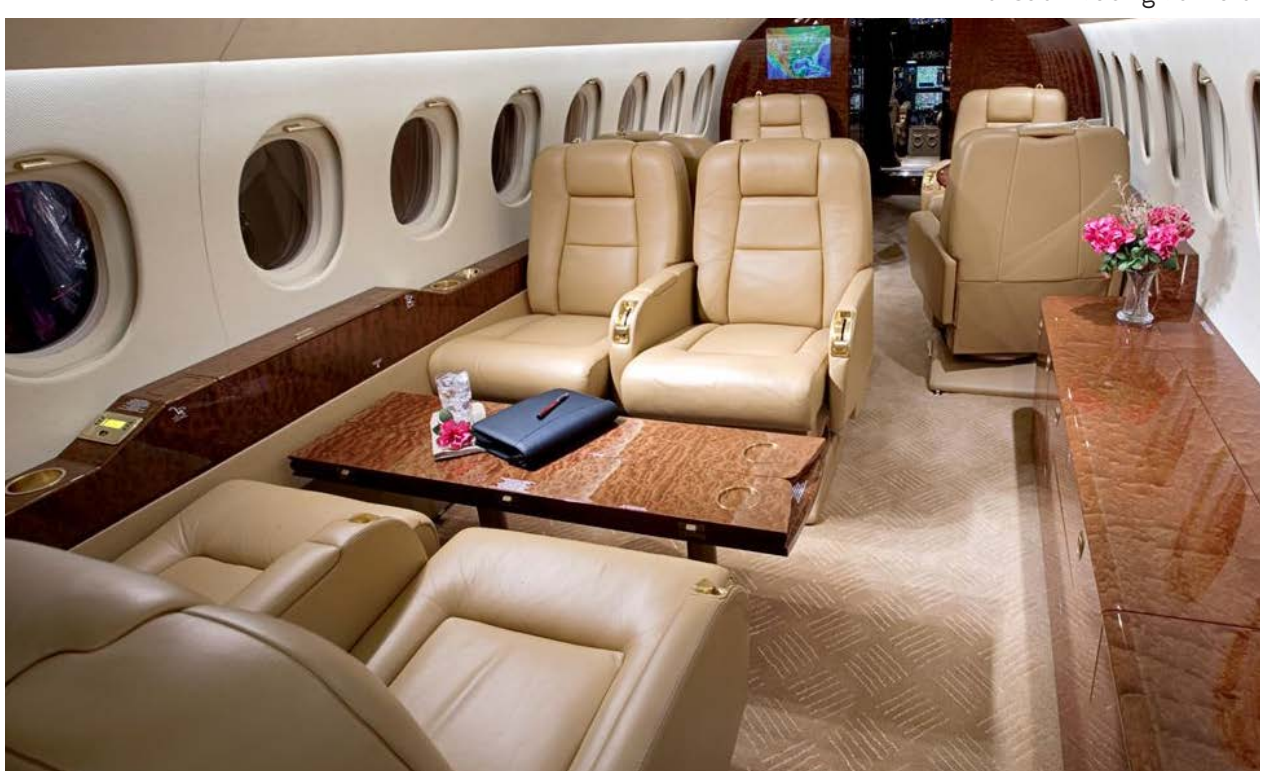
Dining Table Group