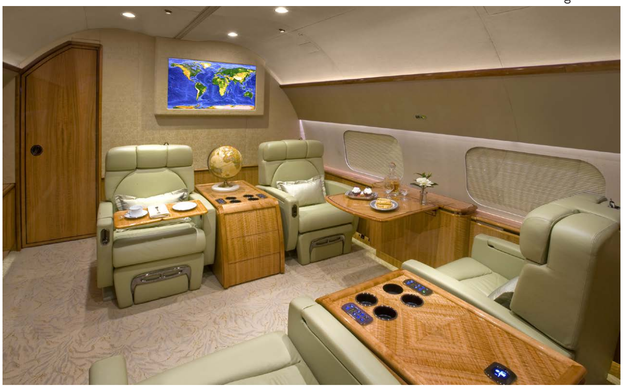
Mid Cabin Facing Aft