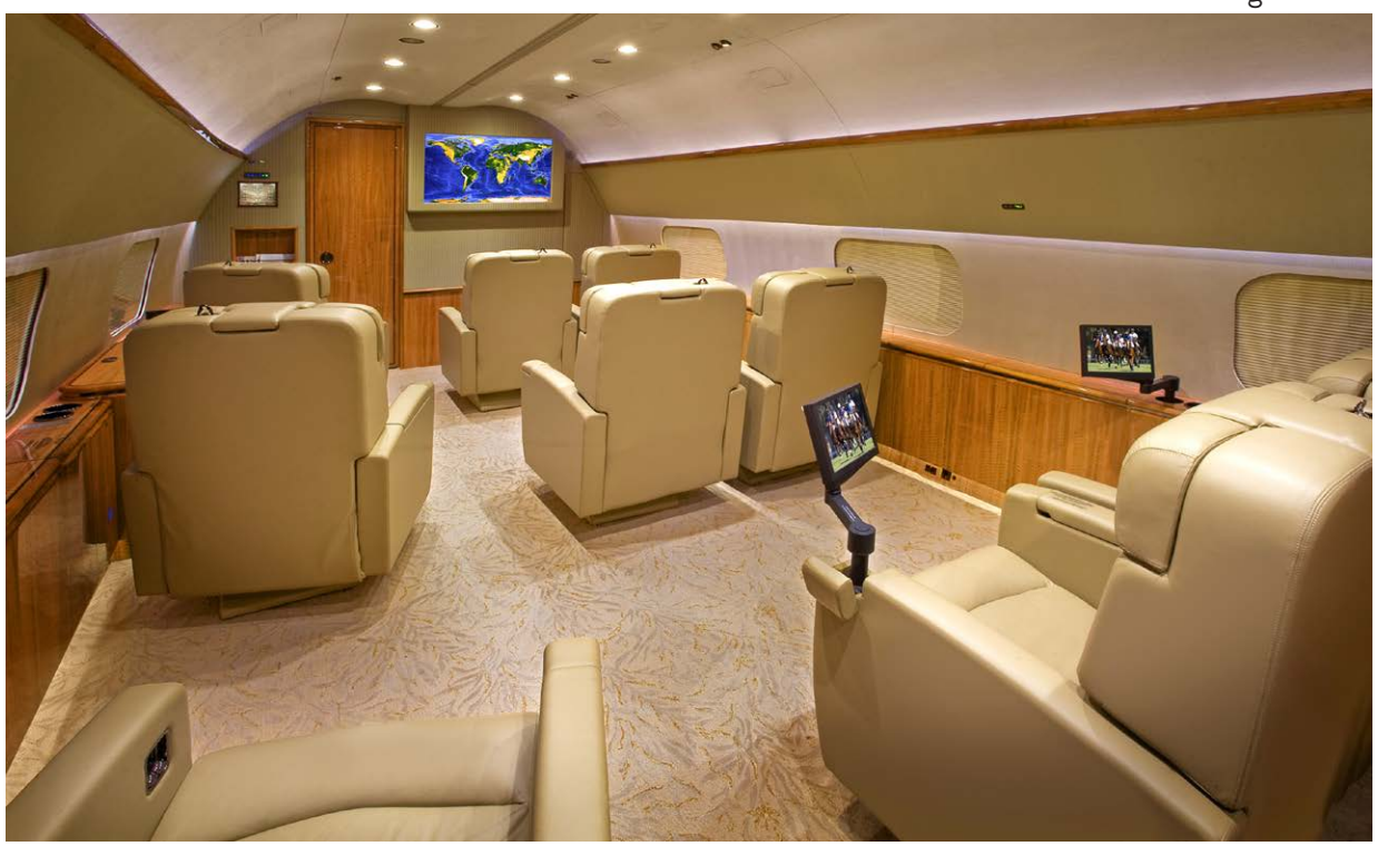
Forward Cabin Detail