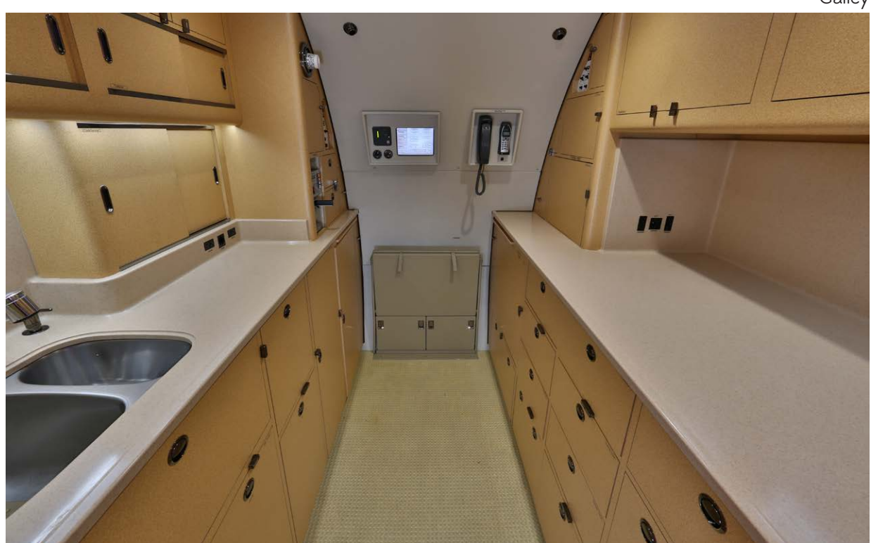
Galley - Open