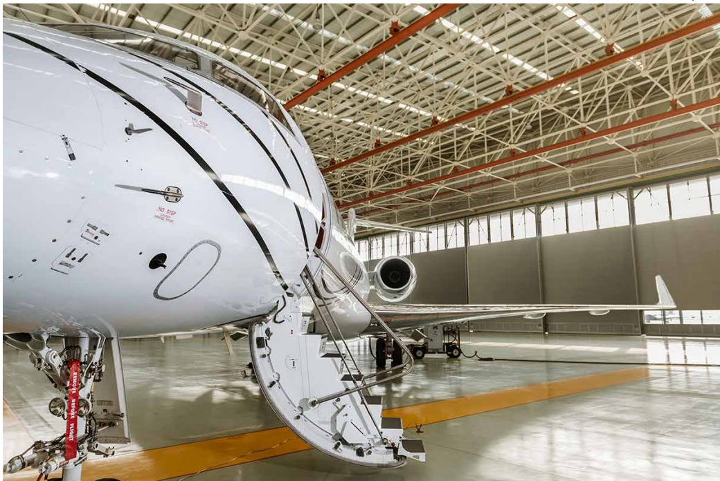
Exterior - Door Open

Specifications and/or descriptions are provided as introductory information only and do not constitute representations or warranties. Verification of specifications remain the sole responsibility of purchaser. Aircraft is subject to prior sale, lease, and/or removal from the market without prior notice.