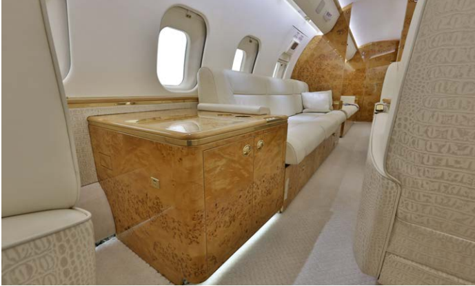
Mid Cabin Credenza