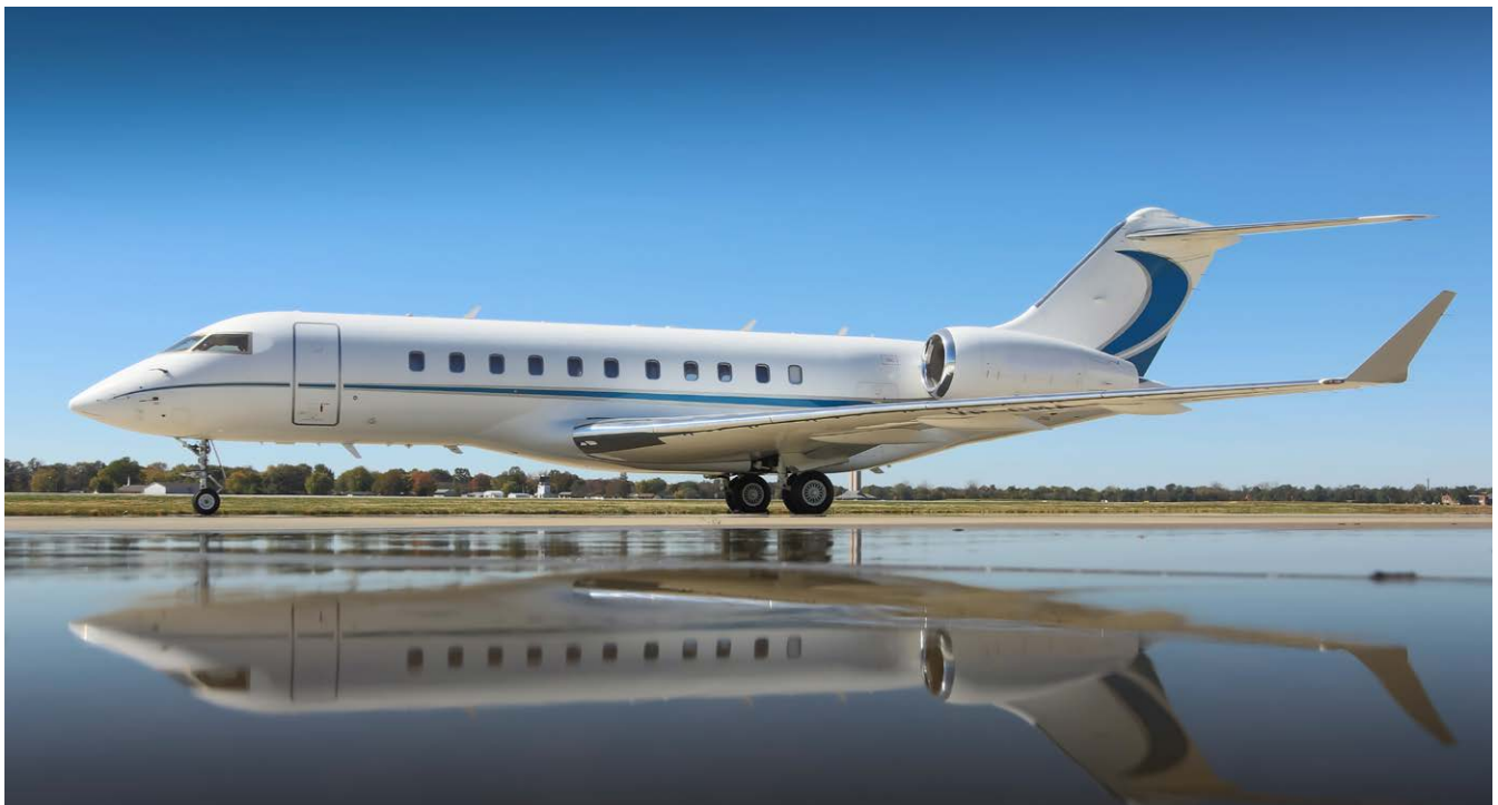
Exterior - Profile

Specifications and/or descriptions are provided as introductory information only and do not constitute representations or warranties. Verification of specifications remain the sole responsibility of purchaser. Aircraft is subject to prior sale, lease, and/or removal from the market without prior notice.