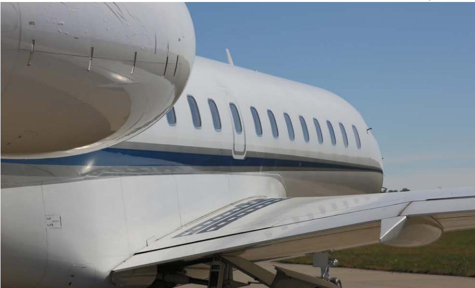
Exterior - Paint Stripe Detail