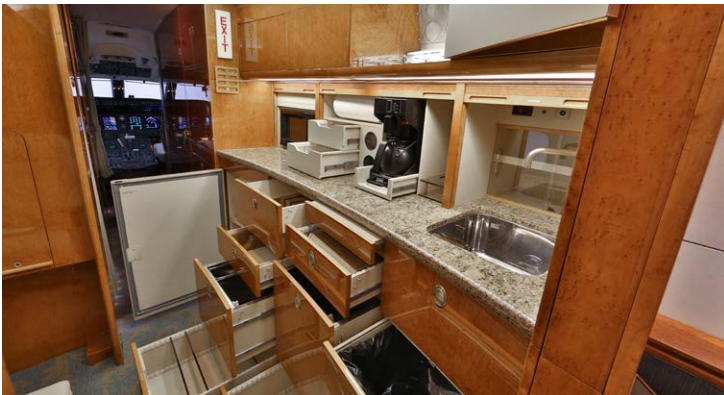
Galley - Open