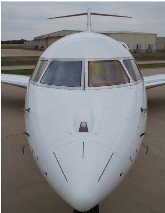
Exterior - Nose View