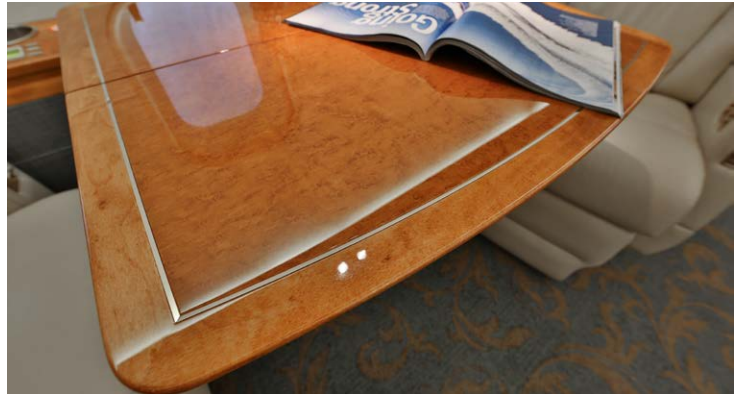
CEO Table Detail