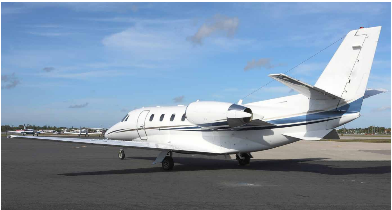
Exterior - Rear View

Specifications and/or descriptions are provided as introductory information only and do not constitute representations or warranties. Verification of specifications remain the sole responsibility of purchaser. Aircraft is subject to prior sale, lease, and/or removal from the market without prior notice.