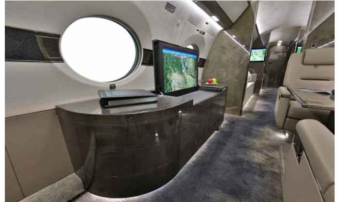
Mid Cabin Cabinet