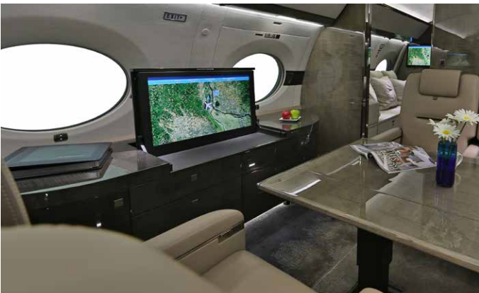
Mid Cabin Monitor