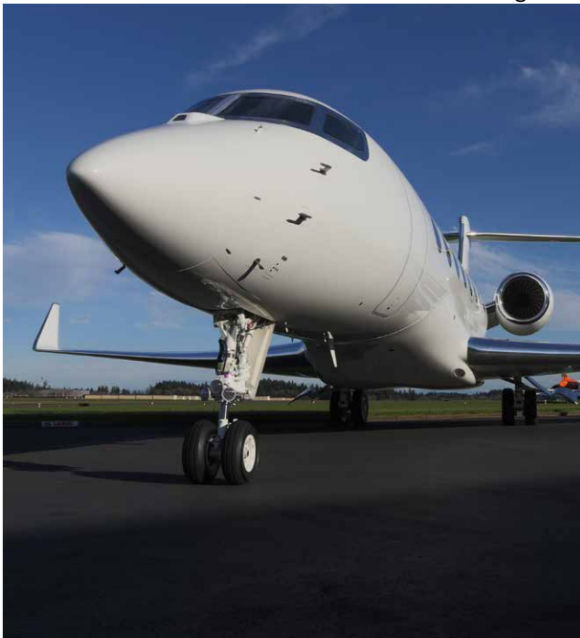
Exterior - Low Quartering View