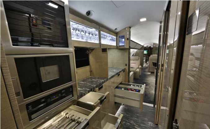
Galley - Open