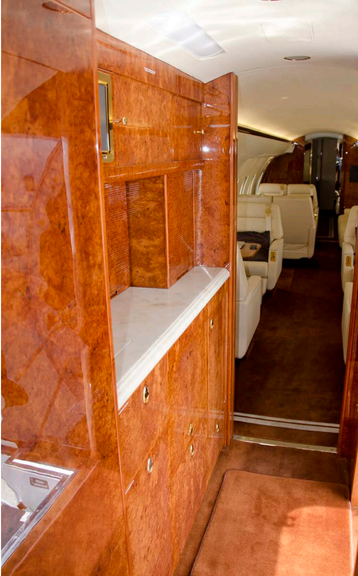
Forward Gally Facing Aft