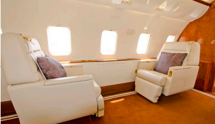
Forward Club Seating