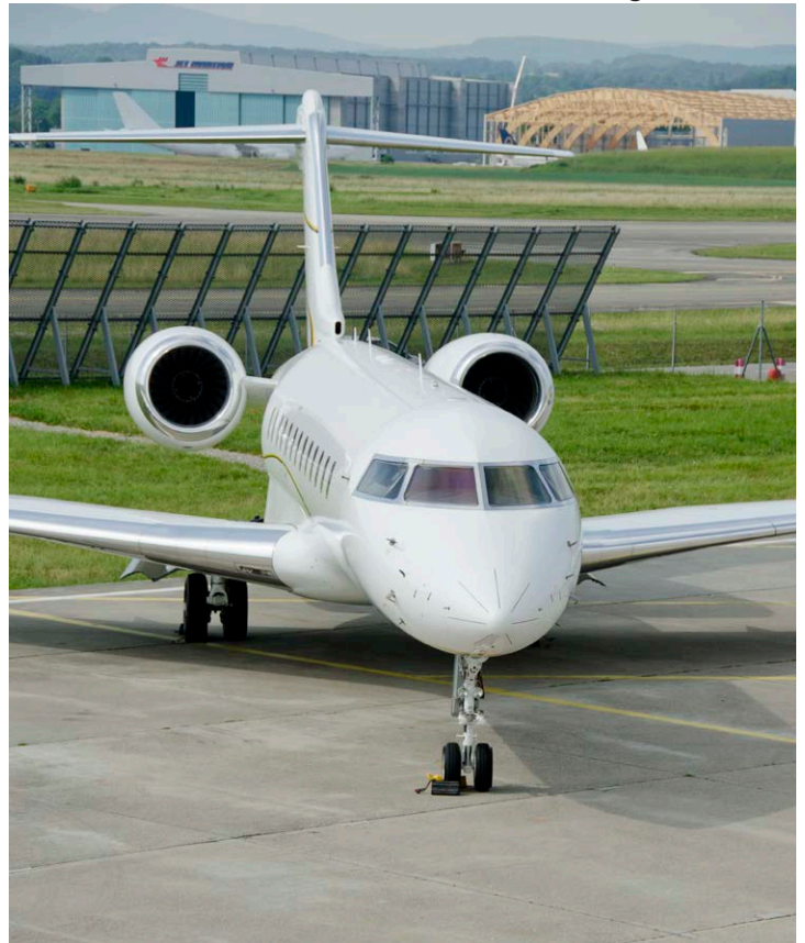
Exterior - High Nose View