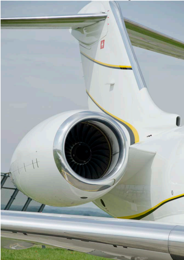
Exterior - Engine and Tail View