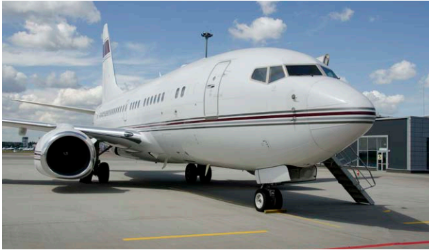
Exterior - Quartering View