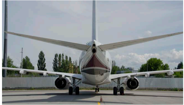
Exterior - Rear View