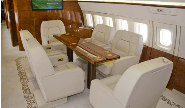
Mid Cabin Conference Grouping