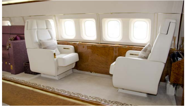
Forward Club Seating