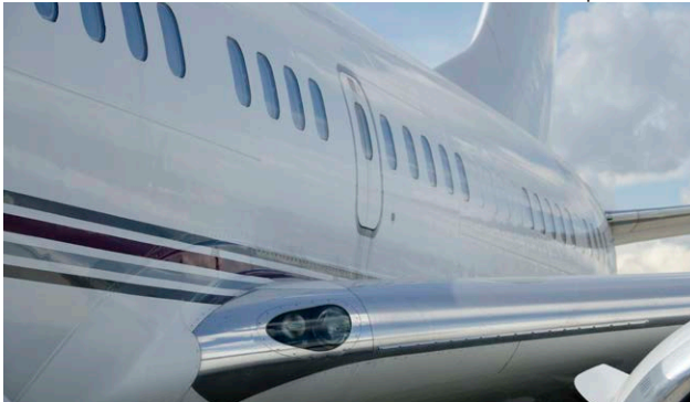
Exterior - Stripe Detail