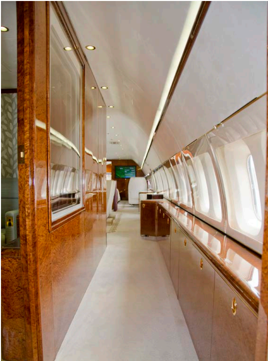
Mid Cabin Hallway