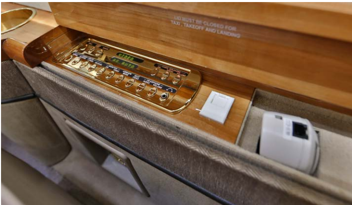
CEO Seat Controls