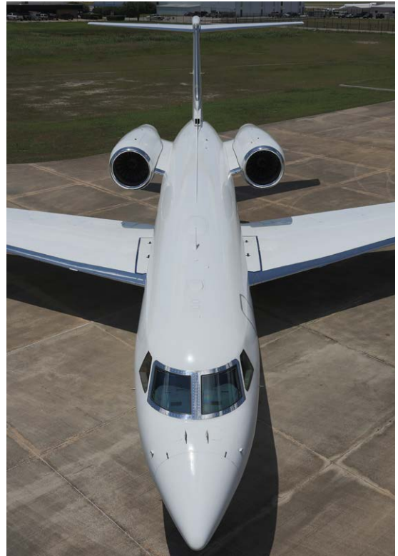
Exterior - High Nose View