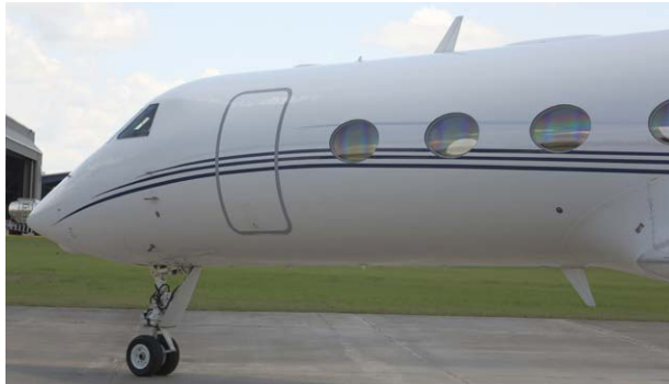
Exterior - Stripe Detail