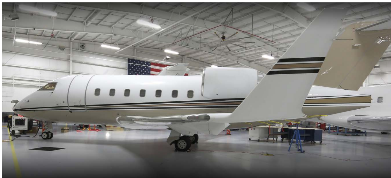
Exterior - Profile View

Specifications and/or descriptions are provided as introductory information only and do not constitute representations or warranties. Verification of specifications remain the sole responsibility of purchaser. Aircraft is subject to prior sale, lease, and/or removal from the market without prior notice.