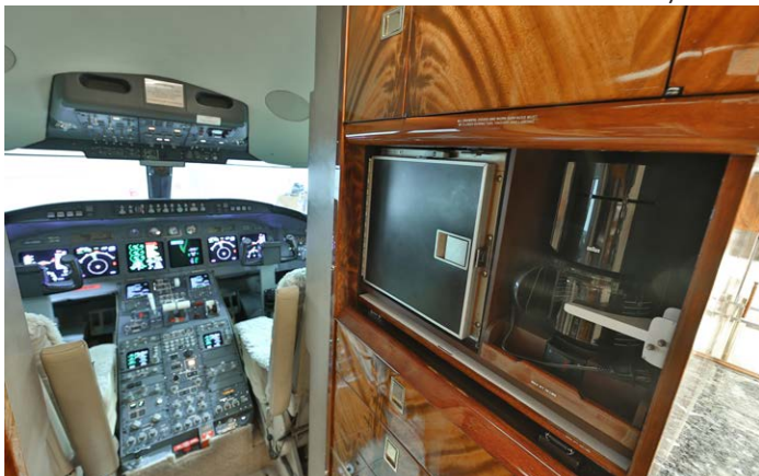
Forward Galley Detail