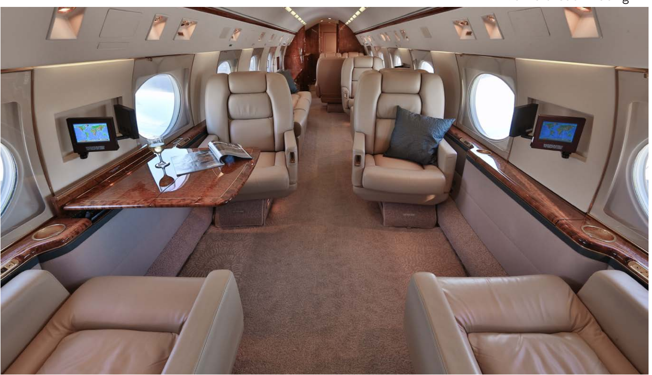
Mid Cabin Facing Aft