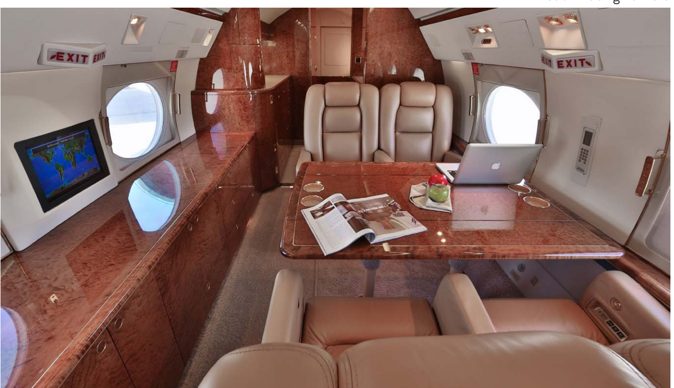
Mid Cabin Facing Aft