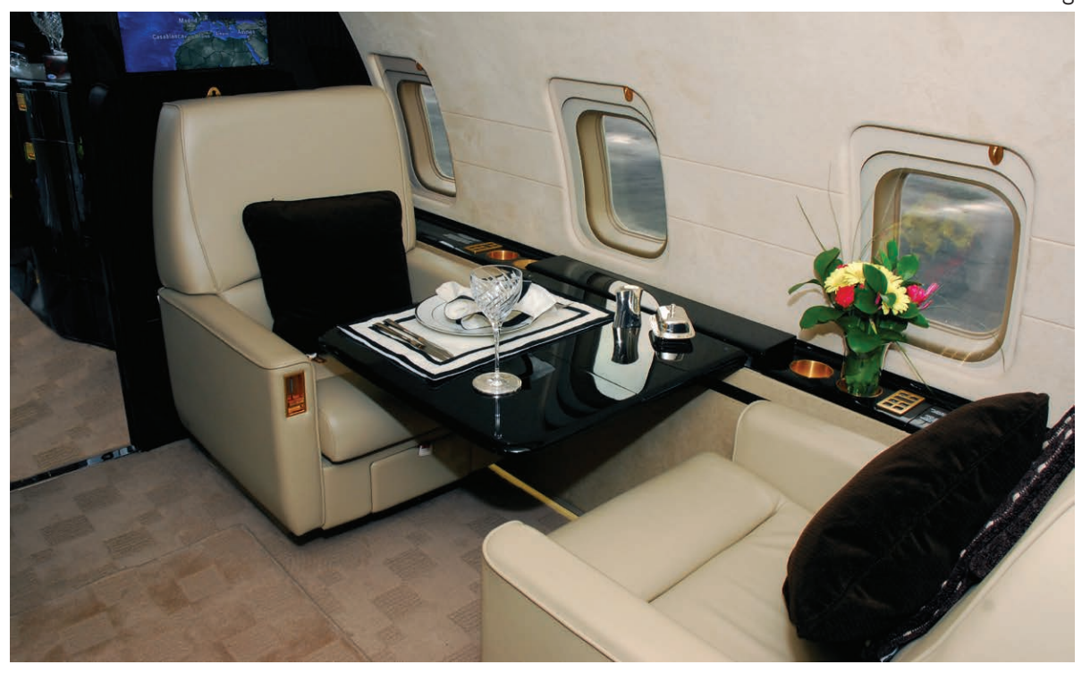
Mid Cabin Credenza