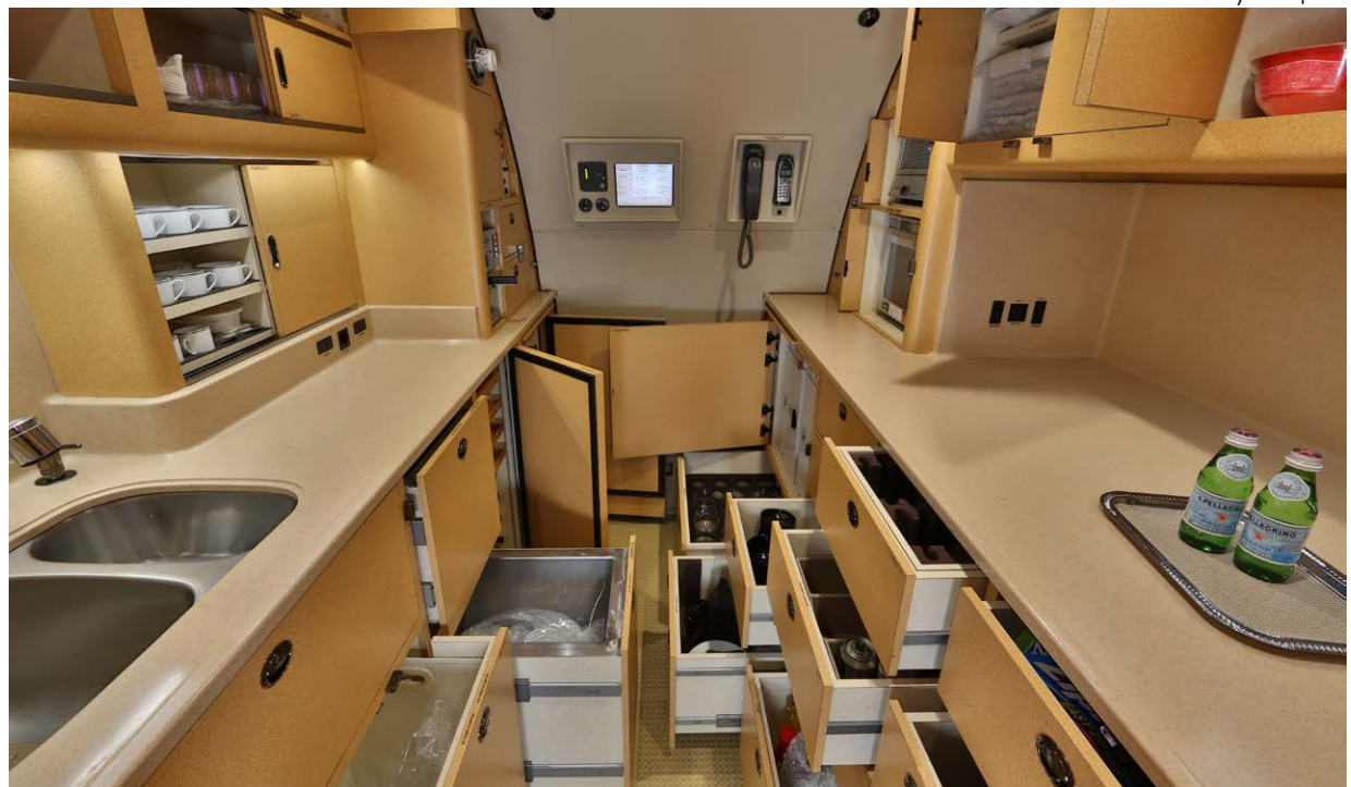
Specifications and/or descriptions are provided as introductory information only and do not constitute representations or warranties. Verification of specifications remain the sole responsibility of purchaser. Aircraft is subject to prior sale, lease, and/or removal from the market without prior notice.