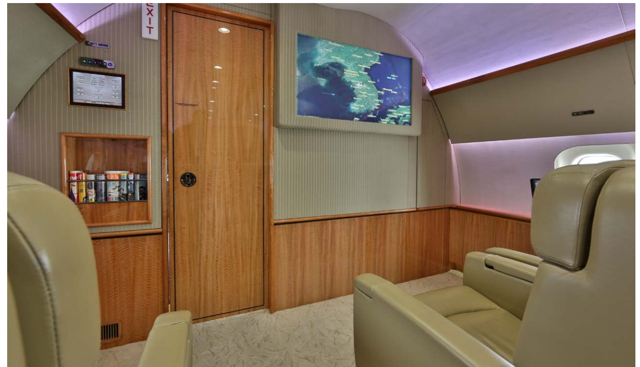
Specifications and/or descriptions are provided as introductory information only and do not constitute representations or warranties. Verification of specifications remain the sole responsibility of purchaser. Aircraft is subject to prior sale, lease, and/or removal from the market without prior notice.