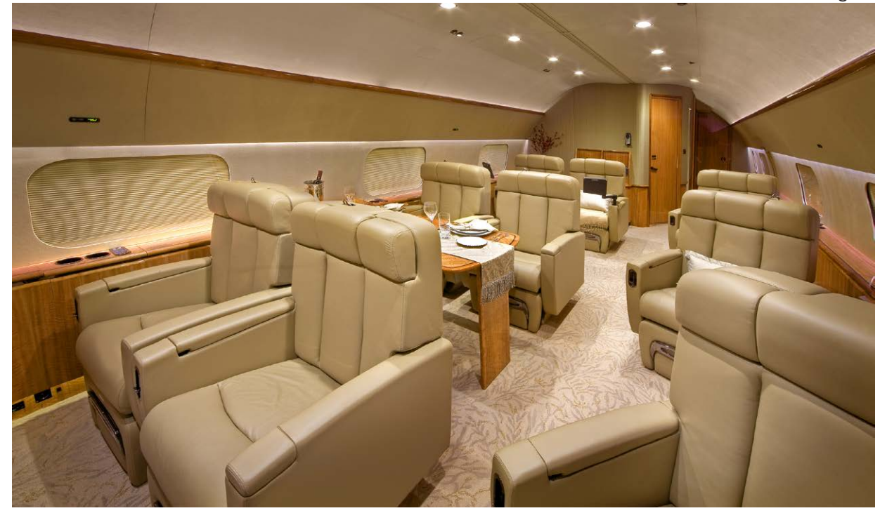
Specifications and/or descriptions are provided as introductory information only and do not constitute representations or warranties. Verification of specifications remain the sole responsibility of purchaser. Aircraft is subject to prior sale, lease, and/or removal from the market without prior notice.