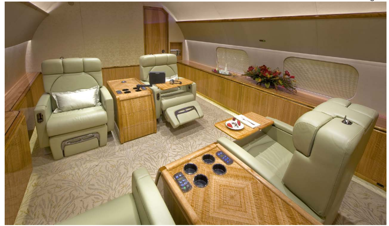
Specifications and/or descriptions are provided as introductory information only and do not constitute representations or warranties. Verification of specifications remain the sole responsibility of purchaser. Aircraft is subject to prior sale, lease, and/or removal from the market without prior notice.