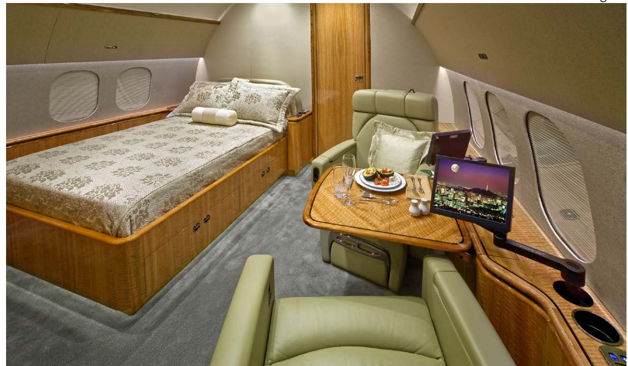
Specifications and/or descriptions are provided as introductory information only and do not constitute representations or warranties. Verification of specifications remain the sole responsibility of purchaser. Aircraft is subject to prior sale, lease, and/or removal from the market without prior notice.