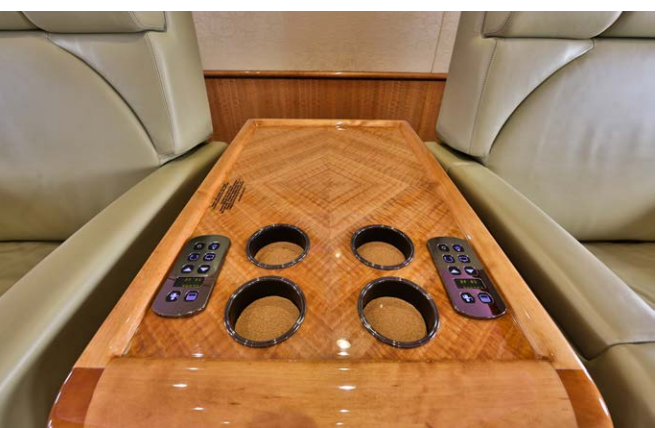
Center Seat Cabinet