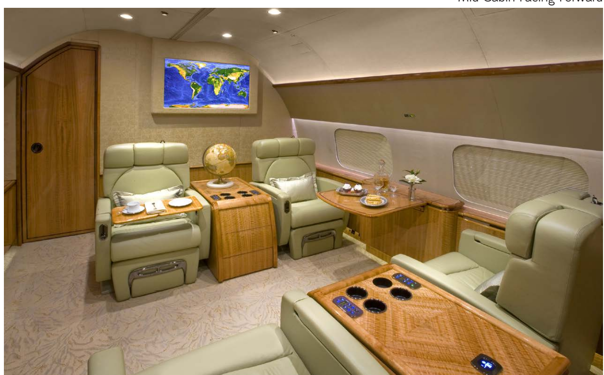
Mid Cabin Facing Aft