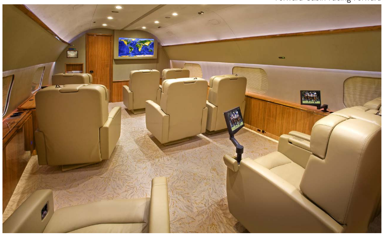
Forward Cabin Detail