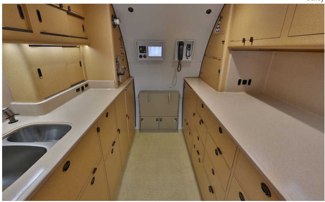
Galley - Open