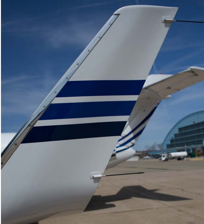
Exterior - Winglet