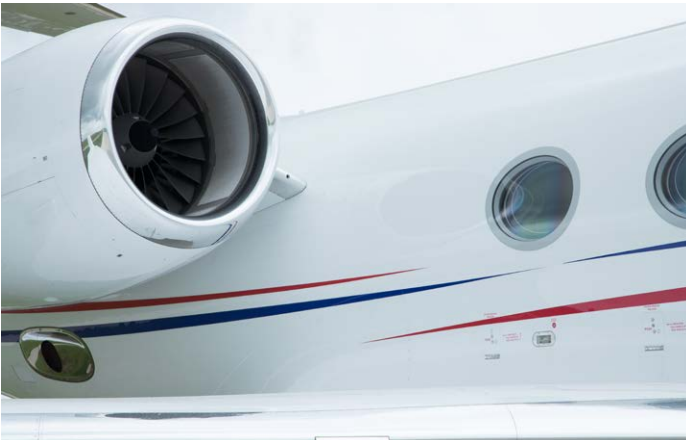
Exterior - Engine Detail