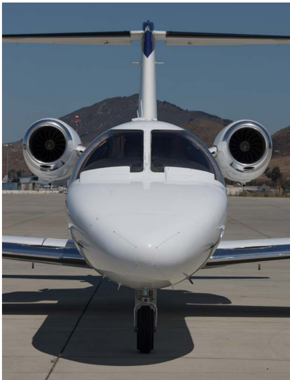
Exterior - Head On View