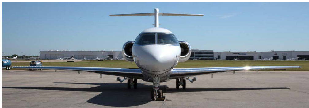
Exterior - Head On View

Specifications and/or descriptions are provided as introductory information only and do not constitute representations or warranties. Verification of specifications remain the sole responsibility of purchaser. Aircraft is subject to prior sale, lease, and/or removal from the market without prior notice.