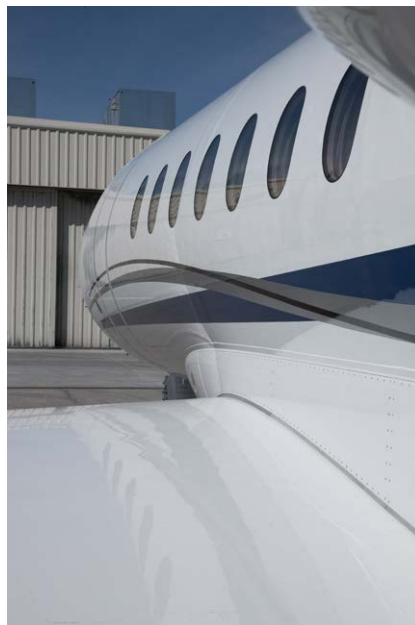
Exterior - Paint Stripe Detail