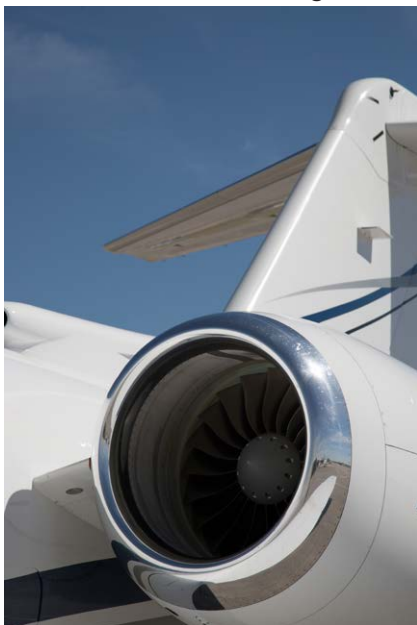
Exterior - Engine View