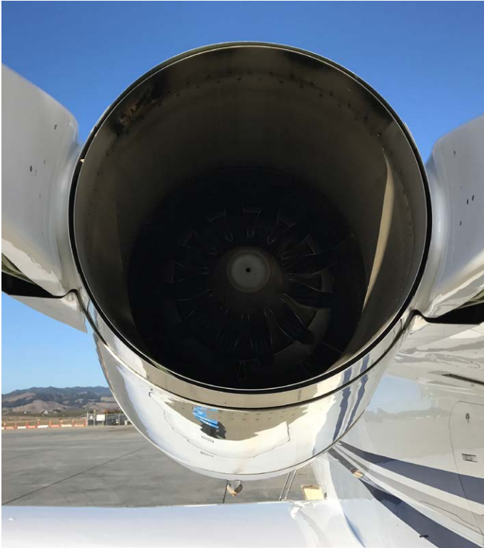
Exterior - Engine View