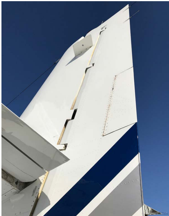
Exterior - Tail Detail