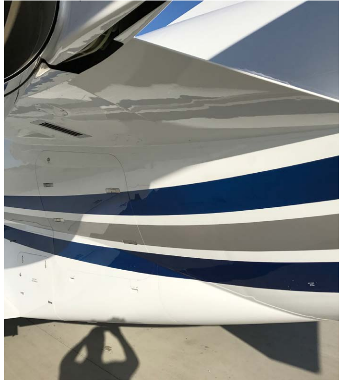
Exterior - Paint Stripe Detail